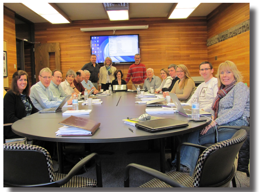
Equine Code development committee

NFACC members support the concept that different viewpoints contribute to robust Codes. Decisions are scientifically informed, but ultimately the Codes reflect the collective judgment of the group. The consensus achieved by the Code Development Committees supports sustainable efforts and continual improvement in farm animal care and welfare. It is the blueprint for Canada's approach.