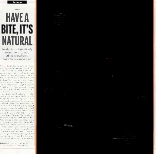
Maclean's Magazine - May 14, 2012