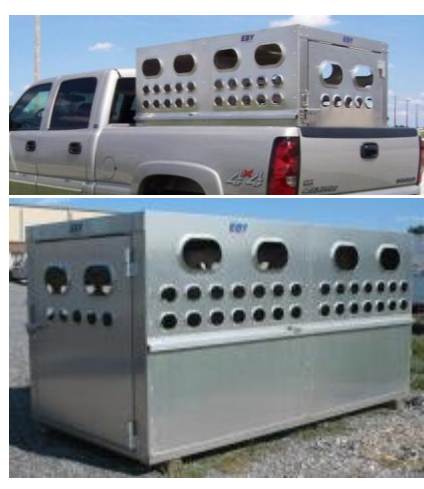
Figure 1: Livestock Box

• Pickup Truck-Gooseneck Trailer – Livestock trailers in various lengths are available in a gooseneck design (refer to Figure 3) that can be coupled with a heavy-duty pickup truck that has a fifth wheel. Again, the trailers can be "spec'd" to meet defined operational needs. The pickup truck licence would have to include a maximum RGW, which would be the combined weight of the pickup truck, the trailer and the load.