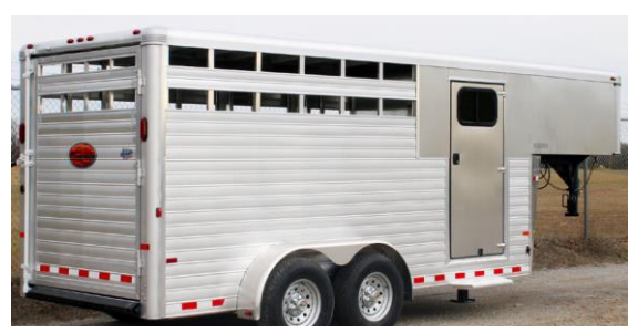
Figure 8: Gooseneck Horse Trailer