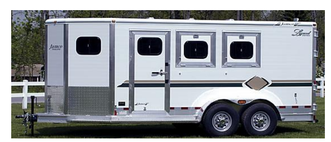
Figure 7: Bumper Pull (Ball and Socket) Horse Trailer

• Horse Trailers – These are trailers that have been specifically designed for the transport of horses, and can include bumper pull (refer to Figure 7) or gooseneck (refer to Figure 8) options that can be pulled by a pickup truck with a fifth wheel. These are typically used for breeding horses, show horses, and horses used in sport, as opposed to slaughter horses, which are typically transported in single deck stock trailers.