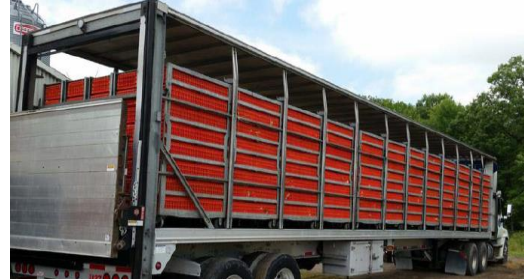
Figure 11: Dolly Carts and Dolly Trailer